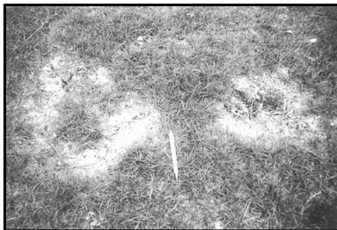
Figure 1. Typical symptoms of patch diseases on Kentucky bluegrass.

Necrotic Ring Spot: Symptoms of this disease usually appear during the last week of May or the first few weeks of June, particularly if dry conditions prevail at those times. The disease appears first as bluish-green wilted grass in patches one-half-foot to three feet in size. These patches quickly become brown as the wilted grass dies. Often, a tuft or patch of healthy turf is present in the center of affected patches, giving the turf a “donut” or “frog-eye” appearance. Below ground, roots of affected tillers have a light brown to dark brown decay.