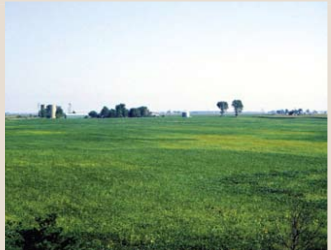
Symptomatic soybean plants growing in an SCN-infested field in Illinois.