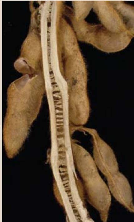
BSR Symptom Internal stem rotting symptom of brown stem rot (BSR) disease. (Tylka)

Nematologists, plant pathologists and soybean breeders have combined efforts to address the