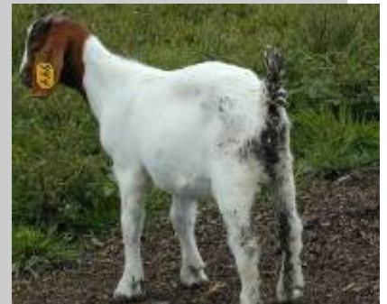
Symptoms of coccidia infection in weanling kid.

High fecal egg counts in spring (500 eggs per gram) or fall (1,000 EPG)