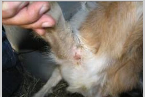
Biting, chewing, skin irritation and hair loss associated with the leg area may indicate a mange mite or lice infestation.