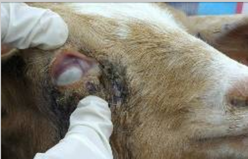
Clouded and weeping eyes indicating a Moraxella species (pinkeye) infection.

Pinkeye Chlamydia, Mycoplasma, or other agents; isolate; systemic and/or topical treatment with oxytetracycline