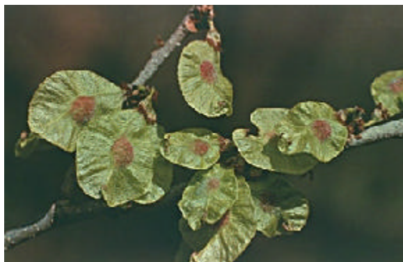
Slippery elm