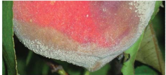
Figure 2. Peach brown rot showing fuzzy gray fungal sporulation on the brown, decayed portions of the fruit.

By John Hartman, U.K. Extension Plant Pathologist