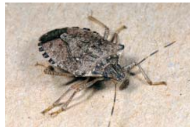
Figure 1. Brown marmorated stink bug

One insect that we will be watching for carefully is the brown marmorated stink bug (BMSB) that was first confirmed in Kentucky this past fall. This new invasive insect pest may be one of the more serious insect