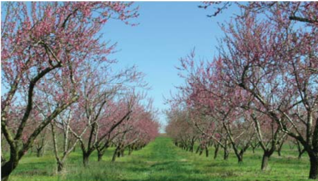
Figure 1. Kentucky peach trees in bloom.

choices. Use of fungicides is most effective if growers have completed winter orchard sanitation efforts such as removing fruit mummies and pruning out diseased branches.