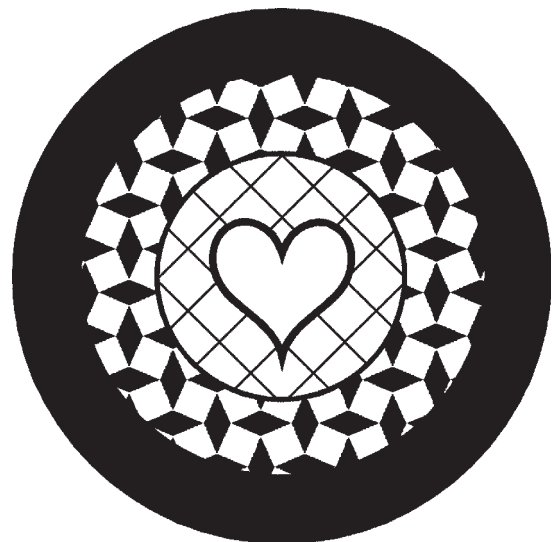
Target of Life

P ut yourself in the center of the heart of the Target of Life. Notice that the heart of the Target is clear, unobstructed, full of light. From there, you see clearly and make choices that are good for you and those around you. You are attuned to your inner guidance and best judgment. You feel at peace, strong, compassionate, joyful, energetic, and creative. Your reflexes are sharp, your immune system strong. You stumble and fall less often, and you handle life's inevitable challenges with more confidence and skill. Your ability to endure prolonged hardship increases. You are naturally more sensitive to others—more patient, generous, and understanding. You more easily express the richness of your authentic self. The more deeply centered you are in the heart of the Target of Life, the more love you feel and share. You are at your best—physically, mentally, and spiritually.