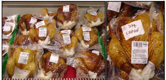
Figure 3. Smoked capons in the display case of a store.

Caponizing produces a unique type of poultry meat. The meat of chickens tends to become rather coarse, stringy, and tough as the rooster ages. This is not the case with the capon. Caponized males grow more slowly than normal male chickens and accumulate more body fat. Deposits of fat in both the light and dark meat of capons is greater than that of intact males resulting in a meat that is more tender and juicier. The older the age at which capons are slaughtered the more flavorful the meat.